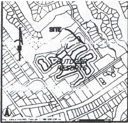
LOCATION MAP (NO SCALE)